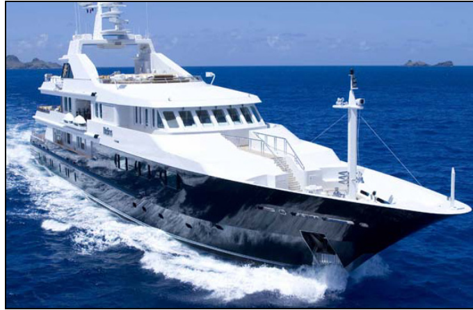
HELIOS: AN AWARD-WINNING PROJECT

The yacht’s former traditional European styling was