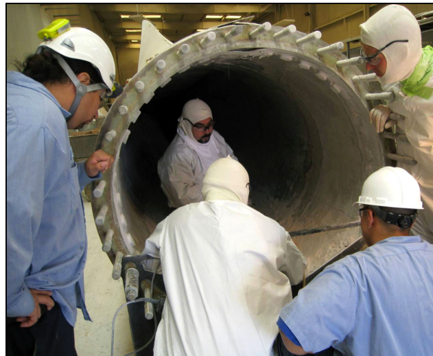
TRAINEES GET AN INSIDE LOOK AT A BLADE.

The on-going classes are conducted at the company's 92,000-square foot facility in National City, CA, located just south of San Diego. The program covers all aspects of blade service and safety, preparing the technicians for full-service field deployment.