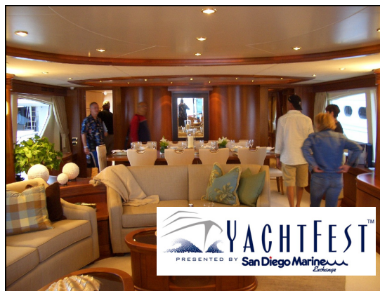
GUESTS ENJOY UP-CLOSE LOOK AT LUXURY

One of the YachtFest's many highlights will be Friday night's VIP