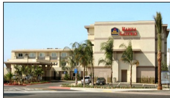
THE NEW BUSTER’S BEACH HOUSE (LEFT) AND BEST WESTERN MARINA GATEWAY HOTEL.

Both first-class facilities have become instant favorites.